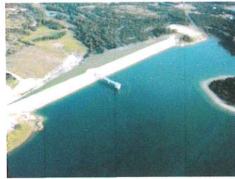
Wheeler Branch Reservoir

Your water comes from Wheeler Branch Reservoir. Wheeler Branch Reservoir is a man made lake located approximately one mile north of Glen Rose. The lake is around 180 acres in surface area and can yield 2000 acre feet of water per year, or about 650 million gallons. A Source Water Susceptibility Assessment for your drinking water source(s) is currently being updated by the Texas Commission on Environmental