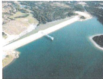
Wheeler Branch Reservoir

Your water comes from Wheeler Branch Reservoir. Wheeler Branch Reservoir is a man made lake located approximately one mile north of Glen Rose. The lake is around 180 acres in surface area and can yield 2000 acre feet of water per year, or about 650 million gallons. A Source Water Susceptibility Assessment for your drinking water source(s) is currently being updated by the Texas Commission on Environmental Quality. This information