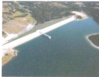
Wheeler Branch Reservoir

Your water comes from Wheeler Branch Reservoir. Wheeler Branch Reservoir is a man made lake located approximately one mile north of Glen Rose. The lake is around 180 acres in surface area and can yield 2000 acre feet of water per year, or about 650 million gallons. A Source Water Susceptibility Assessment for your drinking water source(s) is currently being updated by the Texas Commission on Environmental