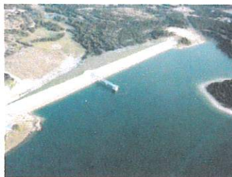
Wheeler Branch Reservoir

Your water comes from Wheeler Branch Reservoir. Wheeler Branch Reservoir is a man made lake located approximately one mile north of Glen Rose. The lake is around 180 acres in surface area and can yield 2000 acre feet of water per year, or about 650 million gallons. A Source Water Susceptibility Assessment for your drinking water source(s) is currently being updated by the Texas Commission on Environmental