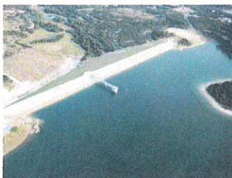
Wheeler Branch Reservoir

Your water comes from Wheeler Branch Reservoir. Wheeler Branch Reservoir is a man made lake located approximately one mile north of Glen Rose. The lake is around 180 acres in surface area and can yield 2000 acre feet of water per year, or about 650 million gallons. A Source Water Susceptibility Assessment for your drinking water source(s) is currently being updated by the Texas Commission on Environmental Quality. This information